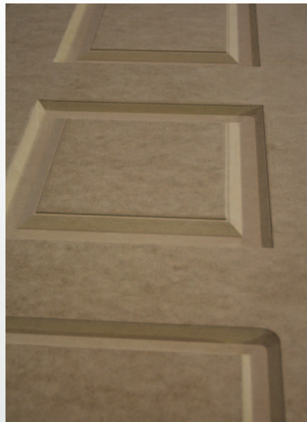
CNC ROUTERS ARE USED TO CREATE CURVILINEAR, ROUNDED AND 3-DIMENSIONAL PROFILES (AND CORNERS) OF SUBSTRATES IN PREPARATION FOR 3D LAMINATION.

3D laminated components are comprised of three basic material ingredients: an engineered wood substrate, adhesive and thermoplastic film that can be formed in three dimensions using heat and pressure. The process, called "thermoforming" is carried out with either membrane pressing, a membraneless pressing or vacuum forming equipment. 3D lamination encapsulates all top and side surfaces of a three-dimensional component, including raised panels, deep recesses, compound curves and intricate side profiles. The process creates a uniform, seamless finish that cannot be duplicated using conventional finishing techniques.