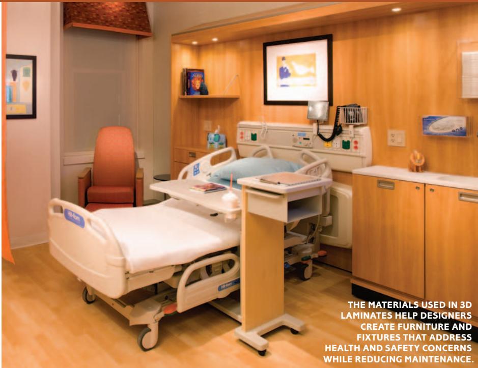
THE MATERIALS USED IN 3D LAMINATES HELP DESIGNERS CREATE FURNITURE AND FIXTURES THAT ADDRESS HEALTH AND SAFETY CONCERNS WHILE REDUCING MAINTENANCE.

The process creates a uniform, seamless finish.